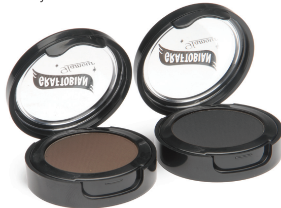
HD Cake Eye Liner Tag

Graftobian Professional Cake Eye Liner yields rich color with long lasting durability. Apply with a #2 Round Brush (p.16) and water or use Magic Set™ (p. 34) for increased durability.