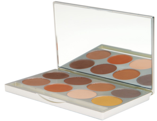
HD Brow Powder Palette #30080

Each of the colors in the #30080 HD Brow Powder Palette are also available individually in 37mm pan refills.